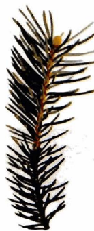
Programme for the Endorsement of Forest Certification Schemes - Chain of Custody Dec 2003