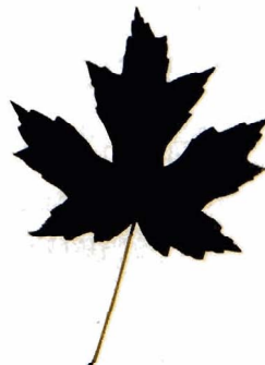
SGS Verified Legal 2004