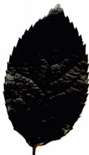
Malaysian Timber Certification Council - 2004