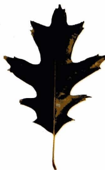
Forest Stewardship Council - Oct 2001

The specialist importer and distributor of wood based panel products, hardwoods, softwoods and hardwood flooring can offer third party certified products across all our range. We are FSC and PEFC chain of custody accredited at all our nine UK sites. For further details contact marketing@lathams.co.uk , telephone 0116 257 3415 or visit www.lathamtimber.co.uk