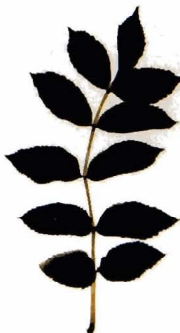
Timber Trades Federation Responsible Purchasing Policy - 2005