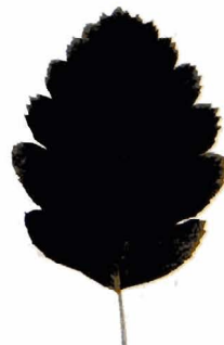
Forest Products Chain of Custody 2006