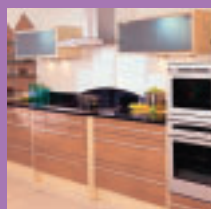
Bespoke Kitchens from Stoneham-see page 4.