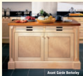
Avant Garde Berkeley