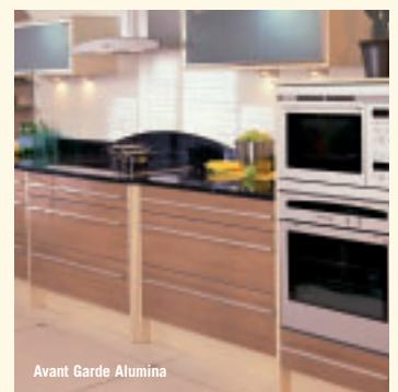
Avant Garde Alumina